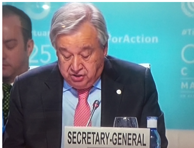
Figure 1: The Secretary General