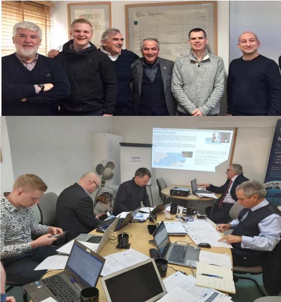
Figure 5 and 6 (above) is of the partner meetings based at Berkeley House.