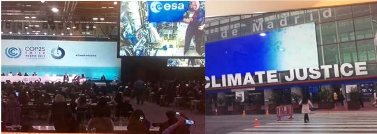
Figure 2: The Conference Setting

Next meeting of COP (COP26) was planned to take place in Scotland in 2020. Any new developments will be reported in the next up-date.